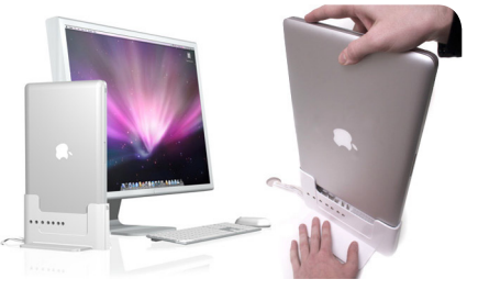
Quickly connect and disconnect all peripherals. This is Henge Docks' docking station for Apple's notebook computers.

Henge Docks created the first truly comprehensive docking station solution for Apple's line of notebook computers. The docks allow users to quickly and easily insert and remove their MacBook computers into a desktop or home theater setup for versatile use. Just plug the laptop into the dock for complete access to all peripherals. When you need to fly, lift out the laptop and away you go. Matt conceived of the idea in 2007 and rented Ashlar-Vellum Argon™ for several months to detail the initial sketches. When the company was founded in 2009 the team utilized Ashlar-Vellum's Reach for Your Dream program giving them Cobalt free for three months and a discount on continuing licenses.