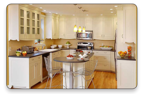
The Puksta kitchen with the pneumatically adjustable table at the end of the island.

Puksta's extended creativity allowed him to develop a commercial product line while renovating his own kitchen. Designers like Fred use Cobalt so that all of their mental energy goes into creating their design and not into how to run their software.