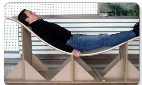
Testing the design during prototyping.