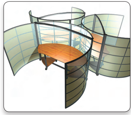
The ORIDJINoffice system can be easily reconfigured in minutes and represents a revolution in partition-based office systems.